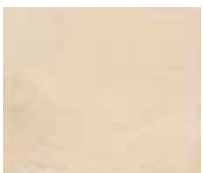
SL MARBLE CAPPUCCINO