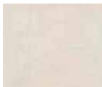
SL MARBLE HUSKY WHITE