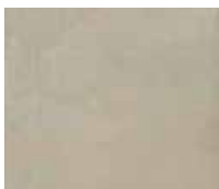
SL MARBLE STONE GREY