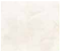
SL MARBLE WHITE