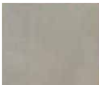
SL MARBLE ASH GREY